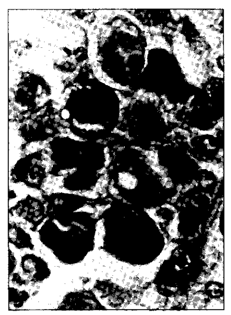
Fig.5. Enlarged view of a tubular lumen of hepatopancreas filled with sloughed epithelial cells and viral occlusions (H&E, X 1,000).