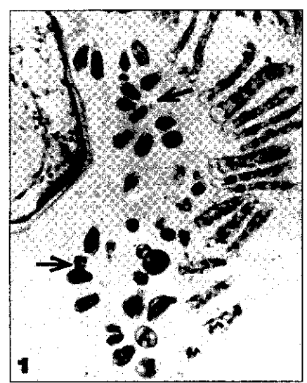
Fig.1. Histological section of gill showing epicommensal protozoan, Zoothamnium sp. (arrow) (H&E, X 100).