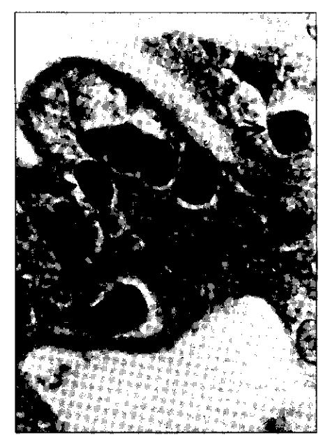
Fig.8. Enlarged view of the hypertrophied nuclei appearing as 'signet rings' (arrow) (H&E, X 1,000).