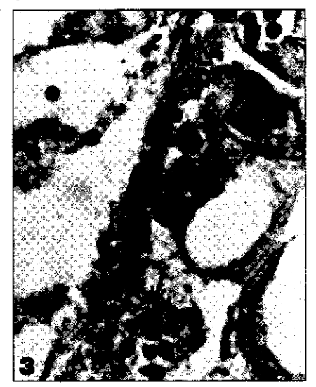
Fig.3. Tissue impression smear of hepatopancreas showing MBV occlusion bodies (arrow) (H&E, X 1,000).