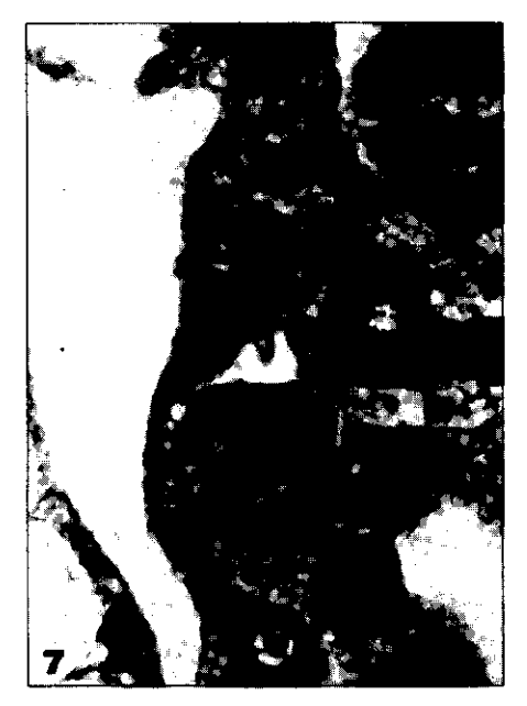
Fig.7. Enlarged view of the tubule showing the hypertrophied nucleus and viral occlusions (arrow) (H&E, X 1,000).