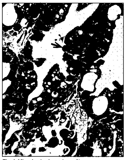
Fig.4. Histological section of hepatopancreas showing necrosis of tubular epithelium. Note the viral occlusions (arrow)(H&E, X 450).

appeared hypertrophied with fragmentation and margination of chromatin material (Fig. 6 and 7). In a few cells, the hypertrophied nuclei appeared as "signet rings" with peripherally displaced and compressed nucleolus (Fig. 8). Thus, hypertrophy of the nucleus with subsequent cellular destruction and desquamation of epithelial cells were the obvious histological changes. Inflammatory reactions with hemocyte infiltration and nodule formation were totally absent in all samples examined. Intertubular tissues were intact without necrotic or inflammatory changes.