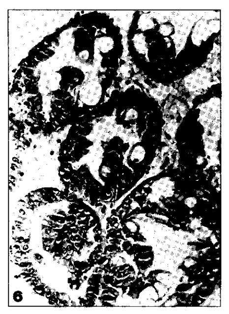
Fig.6. Hepatopancreatic tubules showing hypertrophied nuclei with marginated chromatin material (arrow) (H&E, X 250).