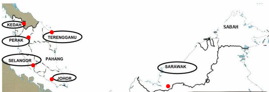
Fig. 1. Map of Malaysia indicating the locations of the sampling sites. The exact locations are indicated with red dots. Map was edited from www.lib.utexas.edu/maps

Samples of M. nemurus , each consisting of 15 individuals (minimum weight of 300g per fish) were collected from six locations in Peninsular Malaysia namely, Kedah, Perak, Selangor (hybrid), Johor, Terengganu and Sarawak (Fig. 1). Genomic DNA was extracted either from whole blood or muscle tissue based on the protocol of Taggart et al. (1992). The isolated DNA samples were quantified on agarose gel by running them alongside with known quantities of \lambda DNA. They were then diluted to similar concentrations ( \sim 50 \text{ ng } \mu\text{l}^{-1} ) to be used in the PCR reactions.